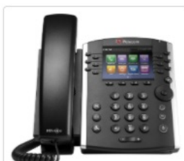
Polycom VVX 411